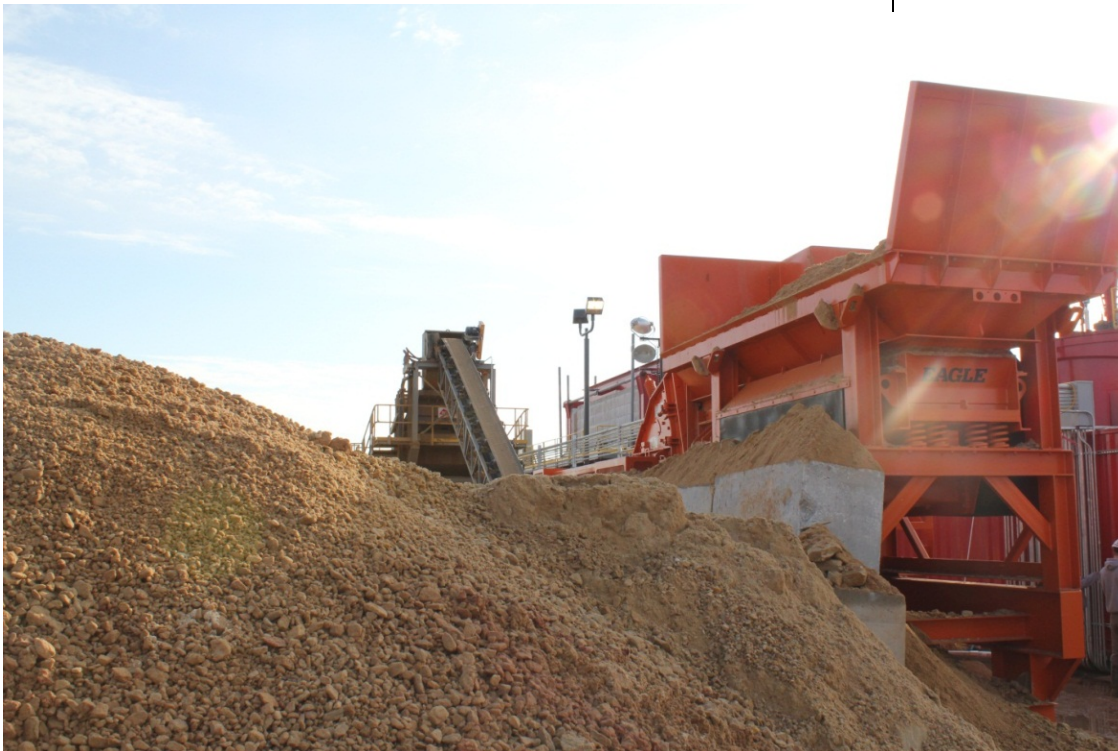
Photo 1: Marshfield: Sand Processing Facility