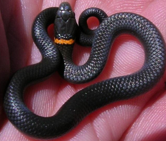
Prairie Ringneck Snake