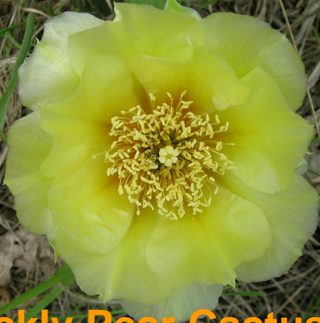
Prickly Pear Cactus