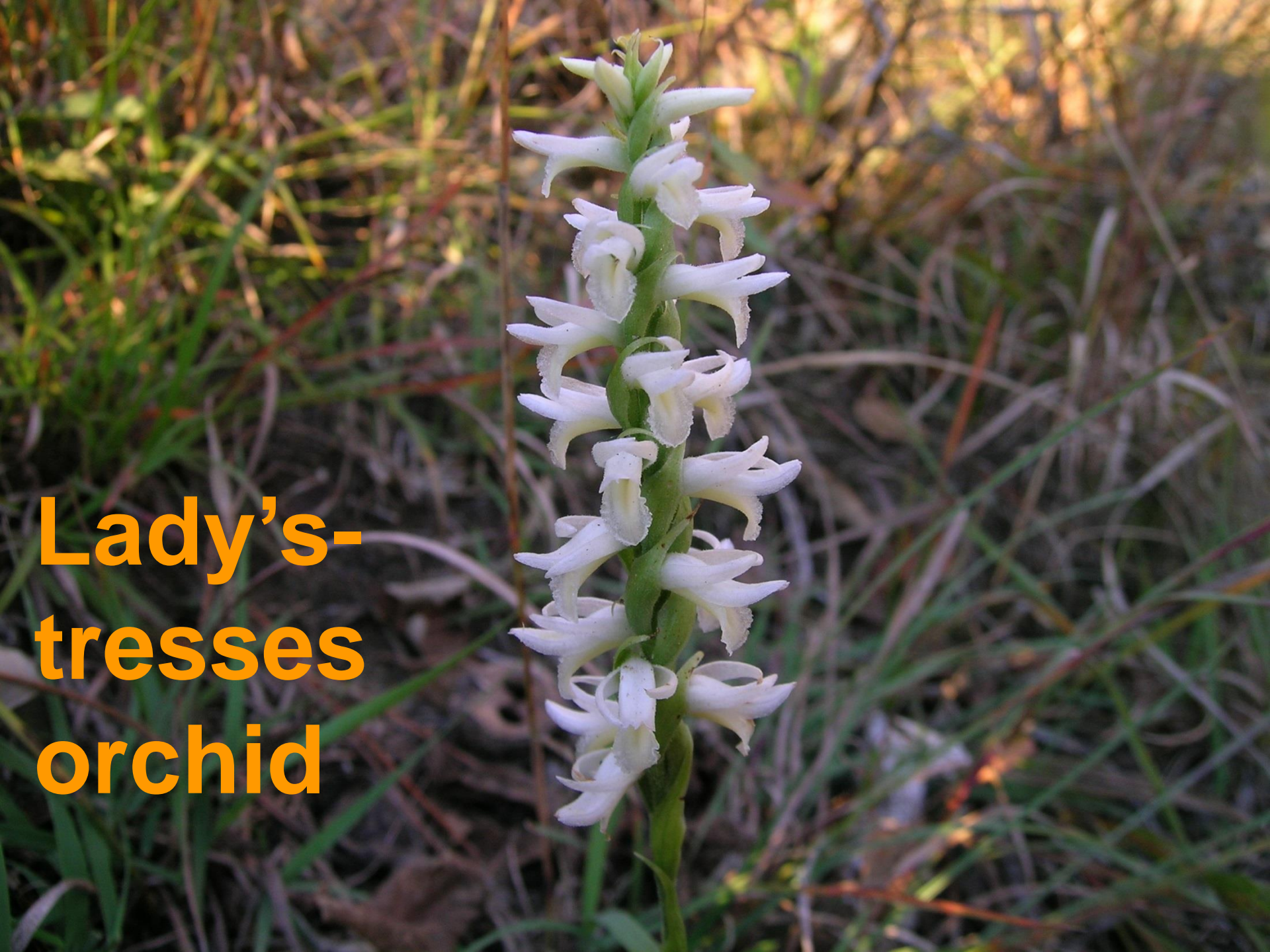
Lady's- tresses orchid