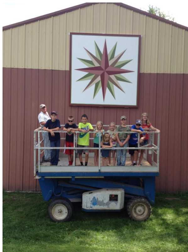
Some of the Hilltop Climbers members present on the day the quilt was hung.