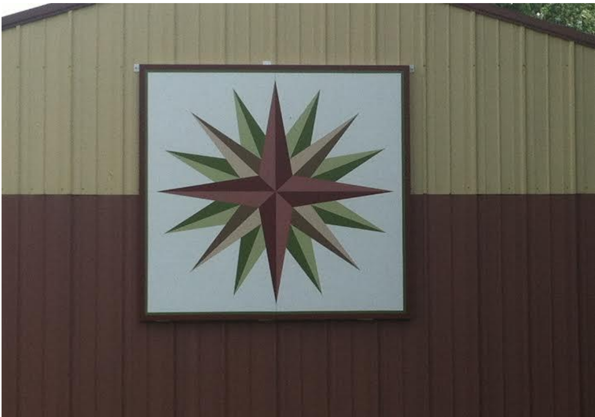
The finished project hanging on the shed

The members learned about teamwork with this project. It took many people to figure out how to draw the pattern to scale, transfer the pattern to the boards so it matched up perfectly, paint the pattern, and to hang the quilts. It was a definite group effort and a neat learning opportunity.